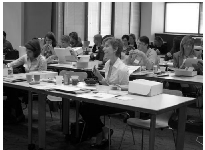
HALL members enjoy box lunches during the third session of the fall seminar.